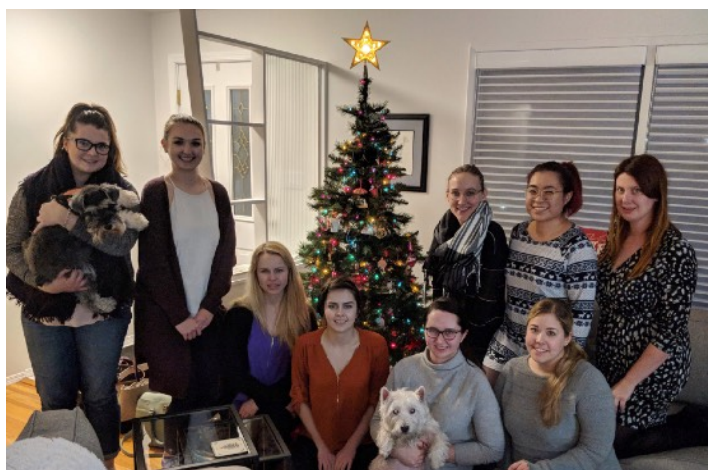
Delta Gammas at the 2017 Holiday Party