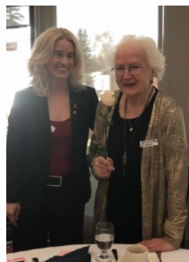
Alumnae at Founders Day