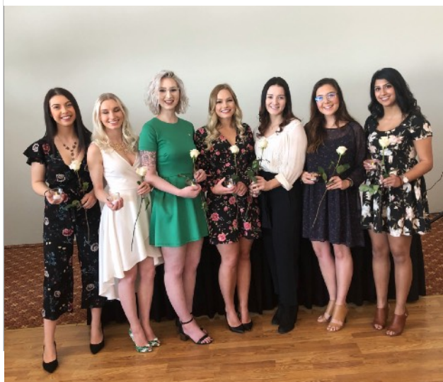
New Alumnae at Founders Day